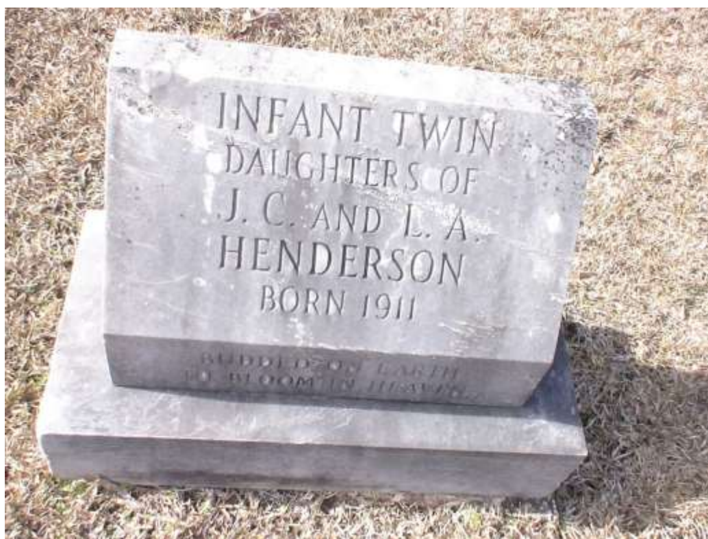
Tombstone @ Beulah Baptist Church Cemetery