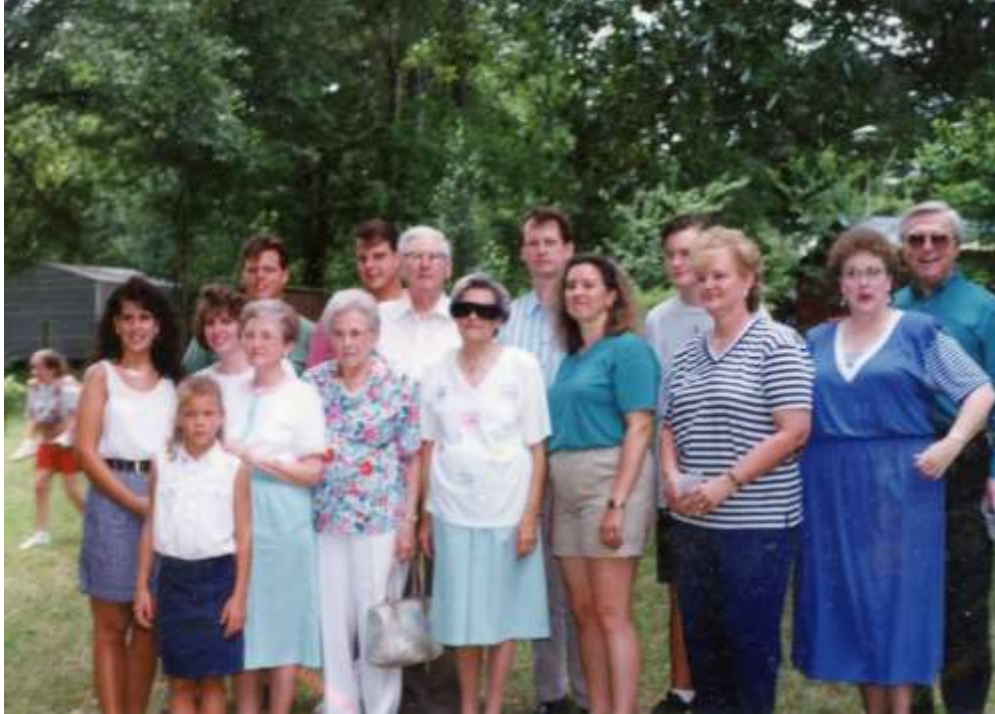
Henderson Family Reunion in Nashville (c1989)